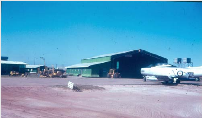
79SQN Maintenance Hangar

At the Operational Readiness Pad (ORP), the two high priority Sabres were positioned at a maximum of 5 minutes standby. That meant from when the USAF Radar station would ring the alarm at our steel hut where the pilots and ground crews were waiting, both aircraft had to be airborne in less than 5 minutes. Most scrambles, an average of one or two genuine scrambles per day, were accomplished in about 90 to 150 seconds. It was simply poetry in motion!