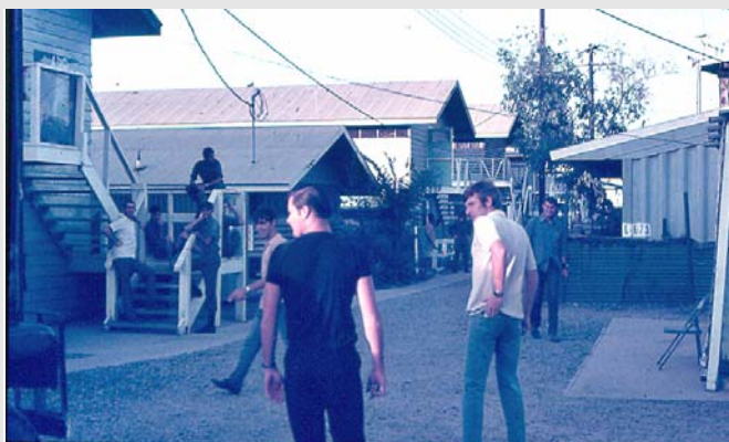
Airmens' Quarters RAAF Vung Tau - 1971

The level of professional satisfaction gained from working in an Active Service area can be outstanding. Basically, we were a group of highly trained and disciplined men whose dependence on one another and support of one another was paramount. The level of cooperation seen at an active service post is one rarely seen in any other post. Although there were up to seven or eight different trades working in the close knit squadron environment, I had not before seen such inter-trade sharing of knowledge, or inter-trade support. For example, when on Duty Crew, if one member had completed his duties for the evening and we Armourers were still cleaning and servicing guns, the other member would offer his support asking if there be any medial tasks he could do which would relieve some of our duties. Likewise, if we completed our tasks early, I offered on more than one occasion, to drive the crane for the Engine Fitters for their engine change. At least this freed one of their fitters to continue on more technical tasks.