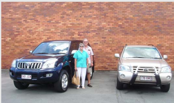
Trading the Kluger for the Prado - January 2006

We were reluctant to trade such a fine motor vehicle without careful thought on the qualities a replacement vehicle should have. So, after a long investigation, we decided to trade the lovely Kluger and we purchased a Toyota Prado Diesel, taking delivery in late January 2006.