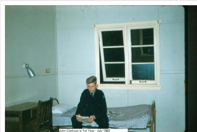
Typical Airmen's Bedspace