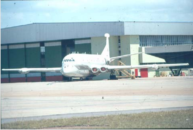
RAF Nimrod at Amberley for Kangaroo Ex - March 1982