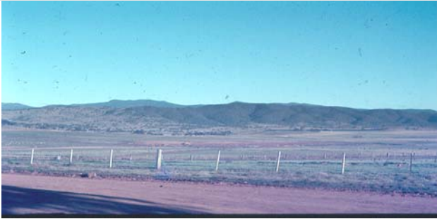
Tuggeranong Range from Campsite - July 1973

In the summer months, when the temperatures out in the field reached the high 30's and often into the low 40's, it was difficult to maintain a full day's work of hard manual labour. So a new system of working hours was introduced. Considering the ACT was by then into daylight saving, we were required to arrive at the site no later than 5.40am, and to be prepared to actually start work right on 6.00am. We would work right up to 12.00 noon, including a half hour break for morning tea and smoko, etc. Then we'd break for three hours during the hottest part of the day to have lunch and a swim in the nearby Murrumbidgee River. Sometimes we'd drive the RAAF vehicles down to the "Pine Island Reserve" on the river, but it was often crowded with picnickers and tourists. So, we'd often drive over the paddocks to another very attractive swimming location and beach site somewhat downstream from the reserve.