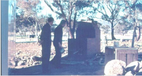
Barbecue and Smelting Site - Sep 1973

We all took turns of swinging the large sledge hammer to break up the hundreds of cast iron bomb heads. Once broken, the pieces were separated into their various metal types. We therefore had piles of pieces of cast iron, piles of lead weights, and piles of brass firing pins. Prior to submitting any of this material to a scrap metal dealer, we had to further de-identify the components. So, at the unit bar-be-que site, a small forge was set up. An old Holden hubcap was found and used as a mould for molten lead. Another old iron container was found and used as a mould for molten brass. Finally, we had our first load for the scrap metal dealer.