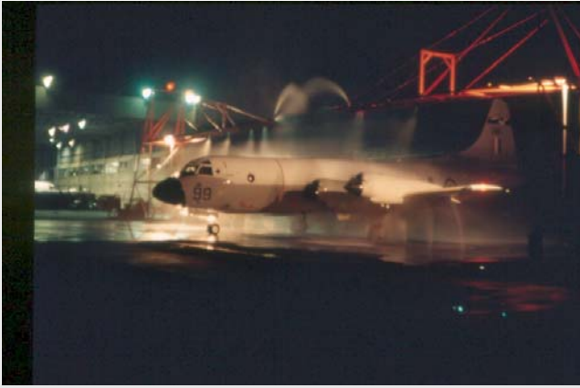
P3-B Aircraft in Bird Bath at NAS Barbers Point, Hawaii - FEB 1980

Early in the exercise, our aircrew were involved in the release of an exercise torpedo on the U.S. navy's torpedo firing range at USS Barking Sands, a small navy base on a nearby island.