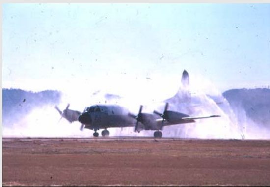
P3-C Aircraft in Bird Bath at Townsville - July 1980