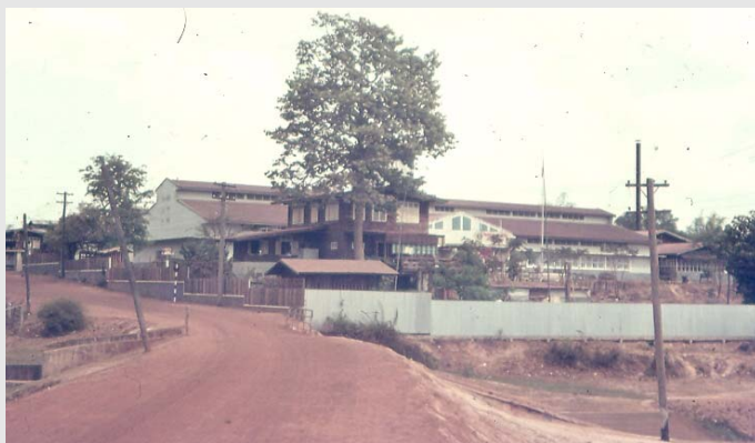
Mekong Whisky Factory - Ubon

We were shown a room with a large wooden bench on which was a large quantity of rice stalk. It had been beaten to almost a mash and according to the guide, was almost ready for mixing with the water and other liquids and the fermenting process. This was quite OK except for the initial sight. On entering the room, we saw at least two dogs walking up and down the wooden bench licking the rice stalk. The guide tried to chase the dogs away before we saw them but was too late!