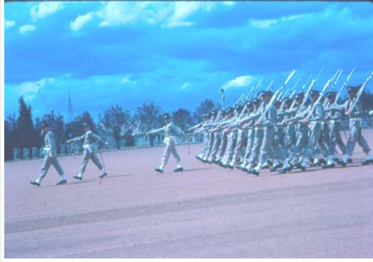
Apprentice Graduation Parade