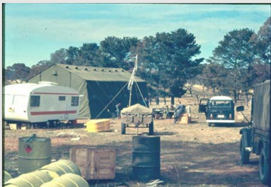
Camp Site - 1CAMD 'A' Tuggeranong - July 1973

Initially, as the area of the original bombing range had been explained and laid out for us, we then commenced to use the locating equipment, (basically, a sensitive and accurate metal detector), to attempt to locate unexploded ordnance.