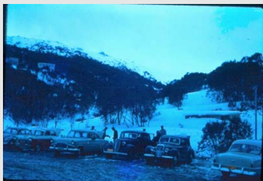
Apprentices at Falls Creek

On arrival we tried out our engine cover sheets as if they were toboggans. By positioning ourselves at the top of a slope, lying on the polyethylene sheet with our hands tightly gripping the front edge of the sheet and someone hold us from slipping by holding our ankles, we were ready to take on the slope. On our shout, the fellow at the back would let go of our ankles and we would slide down the slope at alarming speed. It was outstanding! The only injury for the day happened when one chap, sliding on his polyethylene sheet, went over a previously hidden tree root. Apart from a bruised rib or two, he was fine!