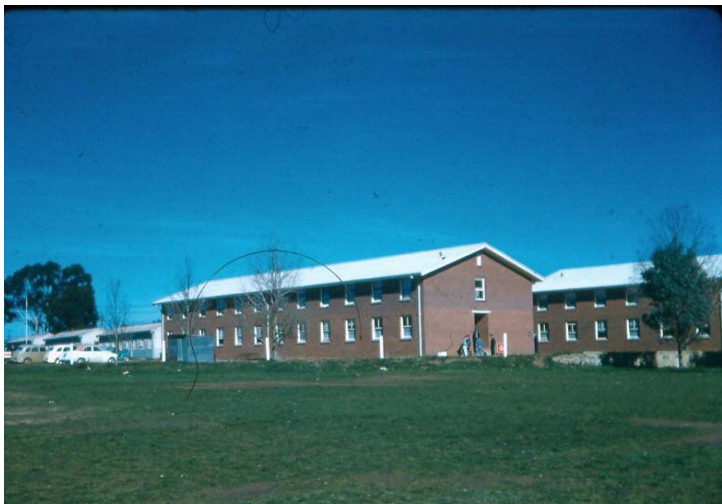
2nd Year Apprentice Quarters - Brick at last