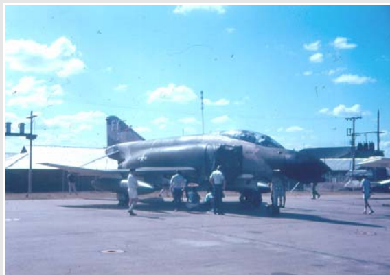
F4 Phantom on Display at Ubon

The Australians accounted themselves extremely well there. After overcoming the initial obstacle the USAF placed on them by calling our aircraft old F86's, the Australians convinced the USAF that the only similarity between the Australian Sabre and the old USAF F86 aircraft was the basic shape. The Australian Sabre had the more powerful Rolls Royce Avon engine, improved airflow through the engine bay and improved avionics. In addition, the Australian pilots were far better trained than most of the USAF 'trained killers'. In the period 1965 - 68, RAAF pilots were frequently seen giving USAF pilots blackboard lessons on air to air tactics, as well as airborne tips in flight.