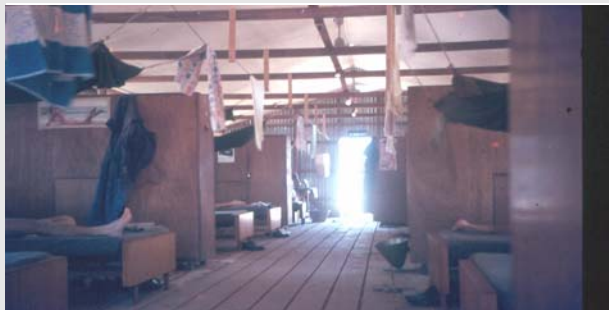
Typical Airmen's Quarters