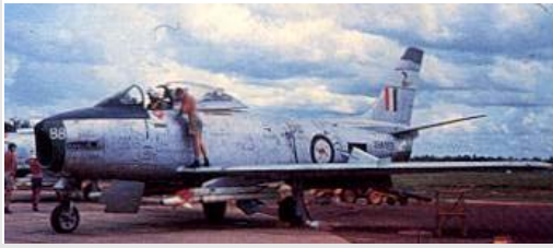
Flight Line - Pilot Strapping In