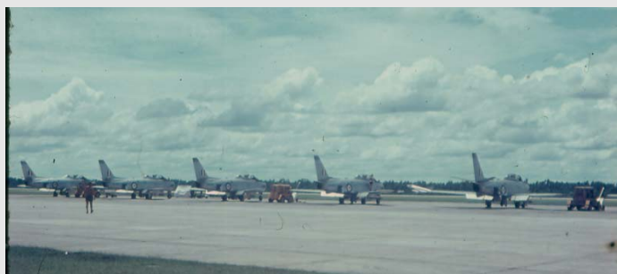
77SQN Flight Line - 1966

To give one an idea of how 10 banners could be achieved in a normal day's work, let us look at a typical day. With the local logistical restrictions, most of the married men lived on the island, and the single men lived on the base. Some pre-flight work commenced around 0720 hrs and all the married men arrived at about 0745 after an hour's journey by bus, then ferry, and bus again. After changing out of uniform and into stubby shorts and work boots, all were working by 0800.