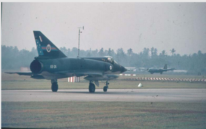
2SQN Canberra & 3SQN Mirage at Butterworth July 1981

In July 1981, I was part of a party to go to Butterworth for one of the “Tug-But” exercises. The Canberra aircraft would be deployed for about 8 to 9 weeks and the squadron personnel would be split into two parties. The first would go up with the aircraft and accompanying Hercules and after 4 or so weeks, would return in a RAAF 707 Butterworth Charter. The second party would travel up in the 707 charter, replace the first party and several weeks later travel home in the Canberra aircraft and accompanying Hercules.