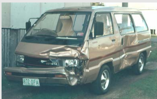
Toyota Tarago after crash - July 1983

The Toyota Tarago was our first new car as a married couple. We had just sold a house due to an imminent posting, and also as our family was growing, the larger vehicle was required. Our Tarago was one of the first release, February 1983. Some people thought they were underpowered, but as we had never owned powerful cars before, we didn't mind. Sadly, when the Tarago was only five months old, we had a serious accident in it just three blocks from home. On a small intersection, a small old Corolla smashed into us from our left at considerable speed. The tarago was out for nearly three months.