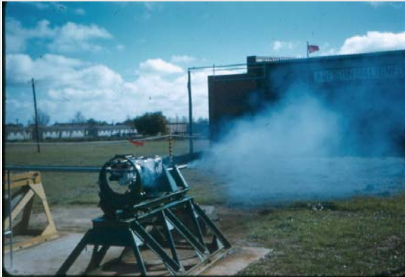
Firing the Aden Gun at the Stop Butts

There were a few memorable occasions which stick to mind. During explosives and demolition training, we all had to prepare our 11lb charge of Trinitrotoluene (TNT), complete with a primer and detonator, ready for inspection. Then the decision was to have morning smoko prior to detonating all our charges. As we were carefully placing our charges into the explosives cabinet, Pat Godman simply tossed his over the heads of everyone there and it landed on top of all the others in the box. A few nervous seconds were followed by Pat getting a bit of a brief. Another demonstration was the demolition of a 60lb high explosive rocket head, and when our instructor set the safety distance it turned out to be somewhat less than it should have been. When he pushed the plunger, we were all sitting behind the Armament Truck, and numerous pieces of steel shrapnel tore through the canvas of the truck.