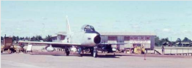
Armed Sabre on the ORP