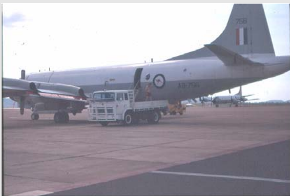
Armourers servicing P3-C aircraft at Townsville - July 1980