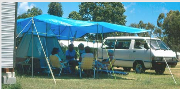
Toyota Tarago - Camping on Stradbroke Island - December 1987