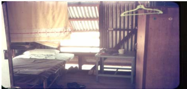
Typical Airmen's Bedspace