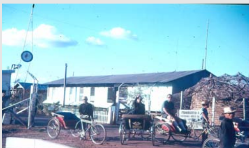
Main Gate at RAAF Ubon

Another event occurred right outside the Guard Gate of the base late one night. I was about to walk across the bitumen road from the gate to the Guard building when I came across the biggest scorpion I had ever seen. It was at least as large as my black Air Force boot. A Thai guard told me to "Stand on it". "Not on your life" I said, as the sting in its tail could easily have reached over the top of my boot. So, without hesitation, the Thai guard shot it, yes, with his M16 rifle. His rifle was pointing down toward the ground, obviously, to hit the scorpion. The scorpion was hit and killed, but we had no idea where the bullet went after it bounced off the bitumen road. Of course, all the chiefs in the world were suddenly on the scene at the sound of a rifle shot and this fellow had some explaining why he fired his rifle. He simply thought he was doing his Australian friend a favour.