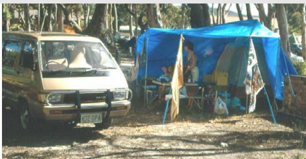
Toyota Tarago at Campsite - December 1983

To provide some transport for us while the Tarago was being repaired, we looked for a small inexpensive car. We saw a little Honda Zot which Margaret fell for straight away. So for a mere $1,000, it was ours. It was incredible! This had a water cooled Honda two cylinder 360cc four stroke engine. Up to about 80km per hour, or around the suburbs, it was a very nippy little car.