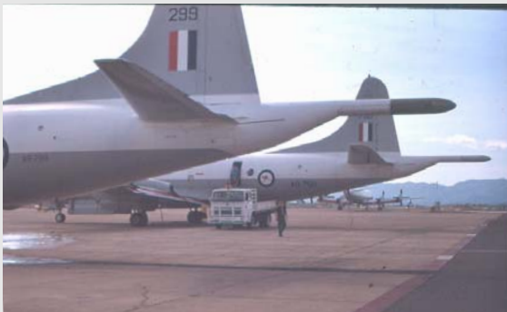
P3-B Aircraft being serviced at Amberley during K3 - October 1979

During the Kangaroo III exercise in 1979, there were a few memorable lessons learnt. Four P3B aircraft were deployed from 11 Squadron to Amberley and four P3C aircraft were deployed from 10 Squadron to Townsville for the four weeks of the exercise. The ground crews for both deployments were allocated from 492 Maintenance Squadron. Unlike the exercises in previous years, both Flight Crew and all the ground crews had weeks of notice of their involvement in the exercise. Each squadron’s deployment consisted of four aircraft and four flight crews. To me, this seemed a waste of aircraft resources, as all the time a flight crew was on crew rest or stand down, their aircraft lay idle. Surprisingly, it was the RNZAF who had the obvious solution. Their contribution to the exercise was one P3B aircraft and three flight crews. As each flight crew left the aircraft, all the aircraft’s systems were left operating and an Avionics Technician boarded the aircraft to monitor the systems until the next Flight Crew arrived. They had practically no unserviceabilities and a small maintenance support team. We had a large maintenance team split into three shifts for each deployment and as our aircraft were being powered up and closed down by each crew, our aircraft had numerous unserviceabilities.