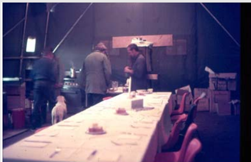
Dining Area - 1CAMD 'A' Tuggeranong - July 1973

Over a period of several months, we leaned a lot about the area, using our equipment to its best advantage and we became much more efficient at locating old practice bombs. The unit became affectionately known as the “Tuggeranong Tent Club”.