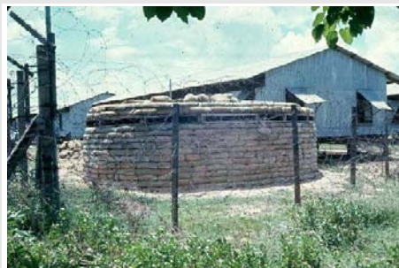
One of the Heavier Ground Defence Bunkers