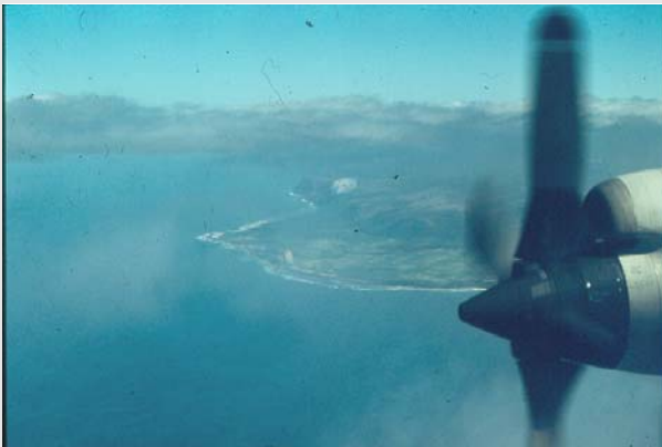
P3-B Aircraft on patrol over Hawaii - FEB 1980

Much of the flying during the RIMPAC exercise was searching for 'enemy' submarines intent on invading the area of Hawaii. This involved round the clock shift work, which was a 12 hours on & 24 hours off system continuing throughout the exercise.