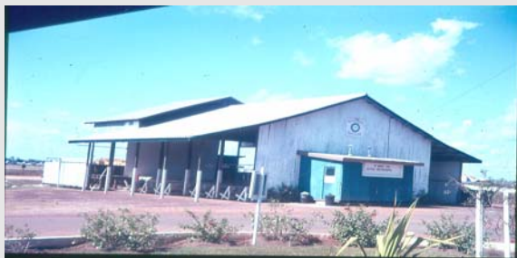
Base Cinema - (Note Runway Behind)

The three messes, the Airmens Mess, the Sergeants Mess and the Officers Mess were always very lively places.