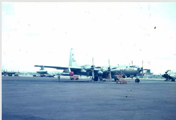
USAF KB-50 at Amberley - 1964

Then, after several social occasions on the base during their three or four day stay, where many a ribbing took place (all in good humour), they began to depart. One of the Australian ground crew members decided on a method to ensure the RAF really put on a good display for their takeoff. This chap quietly told the Flight Leader of the RAF contingent that some of the USAF crews had heard of the fuel load taken by the RAF Victor and expressed their surprise at such a load. The comment continued to the effect that they thought the RAF Victor would have some difficulty taking off from the Amberley 8,000 foot runway. All this was made up of course, just to stir the poms, and it worked!