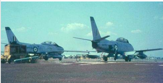
Armed Sabres on ORP - Rear View

An ORP team consisted of two pilots, one Senior NCO of an aircraft trade, and one member of each aircraft trade, i.e., Airframes, Engines, Electrical, Instrument, Radio Technician and Armament. On the sound of an alert, each member had his prescribed duties in order to achieve the aircraft to be airborne in such a short time.