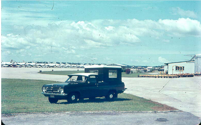
75SQN Flight Line - 1967

In June 1967, when the Israel - Arab six day war was happening, we RAAF people took close interest as the Israel Air Force were operating a similar model Mirage to that used by the RAAF’s 75 Squadron. However, it was heavily emphasised that we were NOT to mention the 6 day war outside the base, as it was very sensitive with Malaysia. The interesting part was that when the war started, the French stopped all deliveries of Mirage spare parts to Israel. So, as if on cue, the Israel Air Force removed all the french Atar engines, and installed the equivalent Pratt and Witney TF30 engines. Likewise with the french DEFA ammunition; apparently the Israel Air Force had expected this so they had tooled up an ammunition manufacturing plant and began to manufacture the 30mm ammunition themselves. Never mind little details like patents!