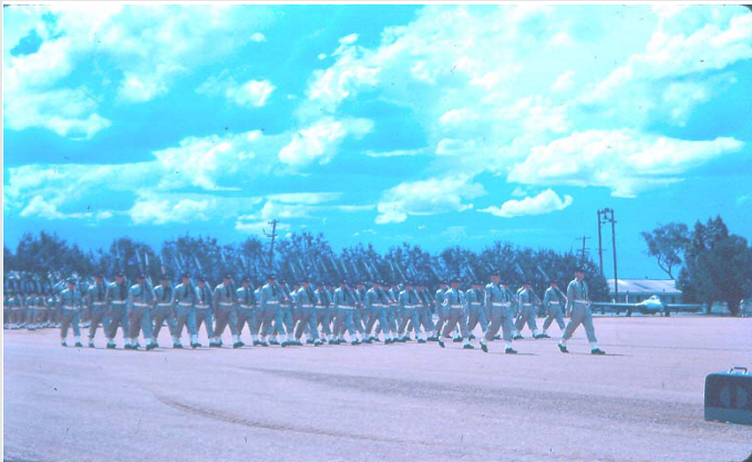
Apprentice Graduation Parade - March Past

The Graduation Ball was a formal Ball held in the unit Gymnasium, and it was mostly funded by the graduating apprentice intake. This funding comprised of a donation of Two Shillings per pay day per apprentice for the entire first and second years, and Ten Shillings per pay day per apprentice for the entire third year. I'm led to believe the Ball cost in the vicinity of Two Thousand Pounds. Consider for a moment that an average tradesman in 1962 would probably earn about 900 to 1100 Pounds per year.