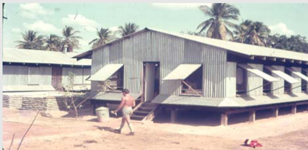
Typical Airmen's Huts