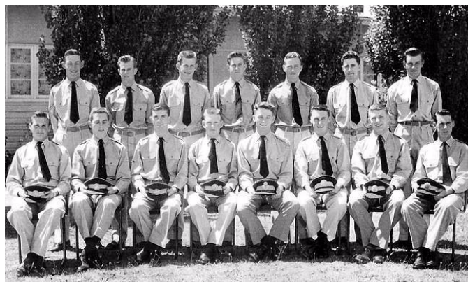
14th Apprentice Armourers

Dress for the Ball was “Formal”, ie, serving Commissioned Officers, Warrant Officers and Senior NCOs were instructed to wear their “Mess Kits” as if it were a formal Dining in night in their own mess.