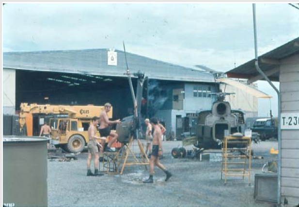
Iroquois Strip & Clean - NOV 1971

Each aircraft, in turn, was completely stripped, cleaned and serviced prior to being re-assembled and prepared for loading. To everyone's surprise, when the aircraft skin was removed from the underside of the aircraft, there were many cases of rice growing in between the frames and ribs and the aircraft skin.