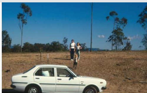
Toyota Corolla at Eatons Hill - July 1984

In 1984, when we made the decision to leave the RAAF, we elected to sell the Tarago to pay off the block of land we had purchased at Eatons Hill. Sadly, we sold the beloved Tarago, even though the sale went to a good cause. As the little Zot was not suitable as the family car, we traded it on a Toyota Corolla. Like its larger brother the Corona, the Corolla was a very reliable car.