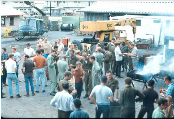
Typical 9 Squadron Barbecue - 1971