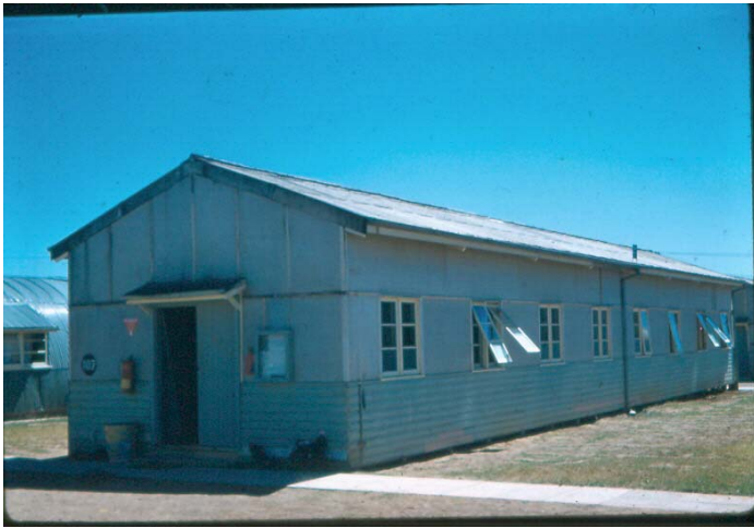
Typical 1st Year Apprentice Hut