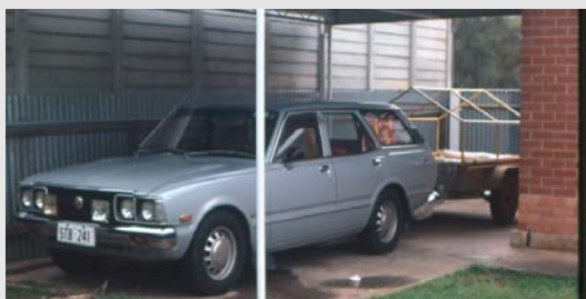
Toyota Corona & Trailer - Adelaide - December 1978

The Toyota Corona wagon was a hugely successful car for us. In the six years we owned it, over postings in three states of Australia, we covered nearly 150,000km. It may not have been a hot performer, but the Corona was immensely reliable, I always ensured the servicings were carried out on time, and always changed the oil and filter every 5,000km. By the time we sold it, the compression had decreased a little, but still very reliable.