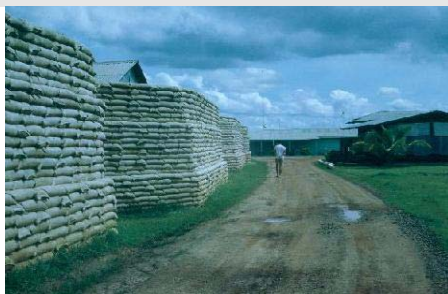
Sandbagged Wall Around Communications Centre

In the period of my tours, I can remember at least two incidents of genuine Sabotage, ie, a large explosion caused by a grenade or other similar object, each of which were to the large power generators for use by the operations section, communications section, and all barracks and catering sections.