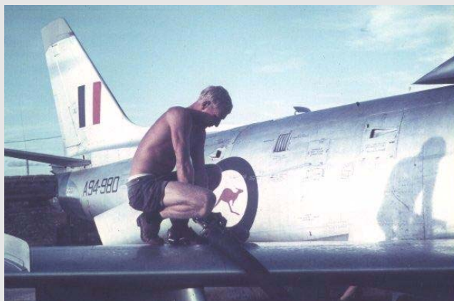
Sabre Overwing Refuelling

Quite surprisingly, JP4 Aviation Fuel is still in use today at some US military bases. I'm not sure just how far the fuel has been improved, but I am aware that commercial aviation companies take extraordinary steps to avoid the fuel where ever possible.