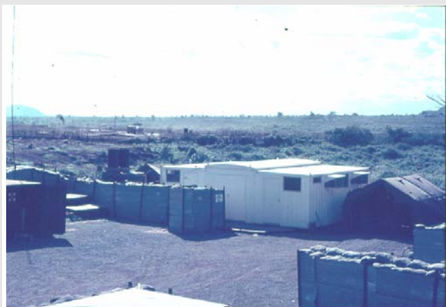
Nui-Dat Fwd Servicing Centre (after rebuild) -

Early in 1971, the squadron submitted a request through the proper channels for an Army Engineer unit to renovate the squadron re-arm centre at Nui Dat. Instead of having our tools, spare parts, rations, etc., stored in tents, the request was for three inter-connecting airconditioned 'ATCO' type buildings to be installed. For this to be accomplished, the area needed to be levelled, a retaining wall installed, a power unit installed, and then the buildings supplied and installed. So while the written request was being officially processed, the 9SQN airmen called on the troops of the Army engineers unit. The troops duly arrived and gave us a "quote" for the installation task. After much negotiation, an agreement was reached and work began immediately. The troops performing the task were provided with appropriate 'refreshments' during the course of their operation, and a payment of x number of cartons of Tooheys was paid on completion. It was simply the way things were done. The simple carton of VB became currency in dealing with US forces and the carton of Tooheys became currency in dealing with our own army units.