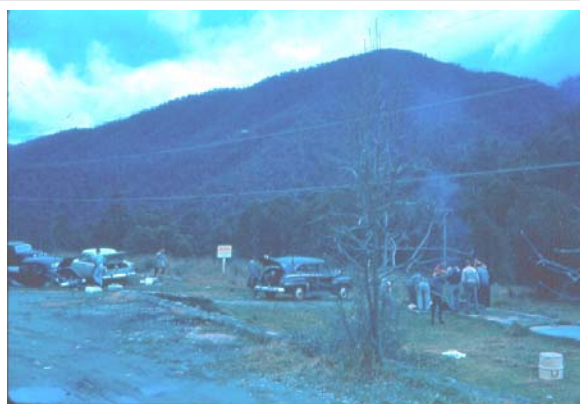
Apprentice Barbecue coming home after Falls Creek