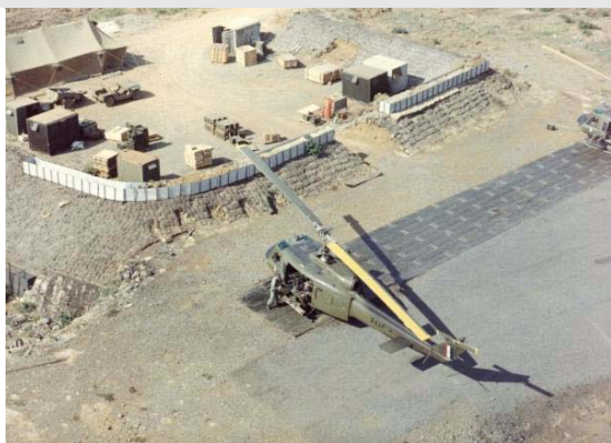
Re-Arm Pad at Nui-Dat

The Nui Dat Forward Arming Crew comprised of one Senior NCO of an aircraft trade, one Flight Fitter “A”, (either an Airframes or Engine Fitter), one Flight Fitter “B” (either an Electrical Fitter, an Instrument Fitter or a Radio Technician), one Corporal Armourer and one LAC Armourer.