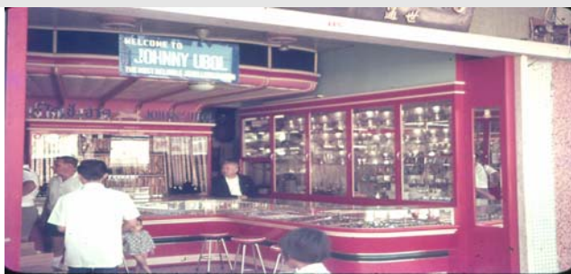
Jewelry Shop in Ubun

During my shopping excursions, I learnt a valuable lesson about when to shop and what to do if there were USAF people in the shop. I was in a good jewelry shop waiting to be served and there were several Americans ahead of me. So, I waited patiently until I thought it would be my turn. However, prior to the last American being served, more of them came into the shop. I saw that all of the Americans were being served before me. (Be aware that it was always easy to tell the Australian apart from the American due to the standards of dress, The Australian serviceman in the 1960's would be in a neat shirt, tailored shorts, long socks and leather shoes when walking off base during the day). Finally, all the Americans had left the shop and I was the only customer remaining. The shopkeeper came to me with profuse apologies and said he was very sorry he did not serve me in order, but he had to serve all the Americans first. When I asked why, he simply replied, "Different price, Australian's price is much cheaper!".