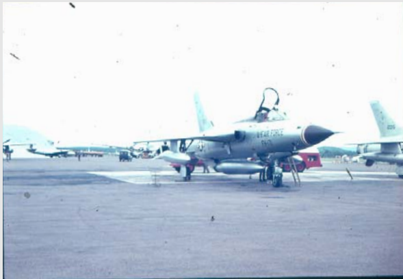
Visiting F105 - Amberley - 1964