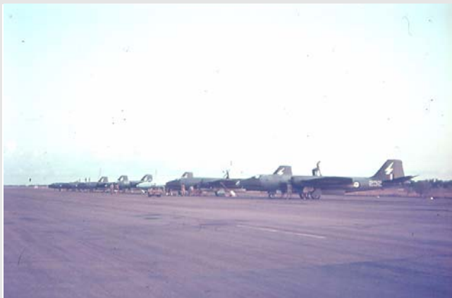
1SQN Tarmac - Darwin - 1964

Squadron deployments usually came with about one day's warning and were about getting a maximum flying rate with heavy bombing on every mission. Not having enough men to have shift work, the whole squadron simply worked from about 0500 through to about 2100 or so, every day for about 10 to 15 days. During the day, ground crews grabbed a short rest between sorties on camp stretchers behind a flight line tent and worked like dogs when the aircraft returned for replenishment and bombing up again. In those days, re-fuelling, preflights, bombing up, etc, all happened at the same time. It was poetry in motion. The squadron deployments in my time included Darwin in May 1964, (the one I missed), August 1964, March 1965, and Port Moresby in July 1965 (Photo Recce only at Moresby).