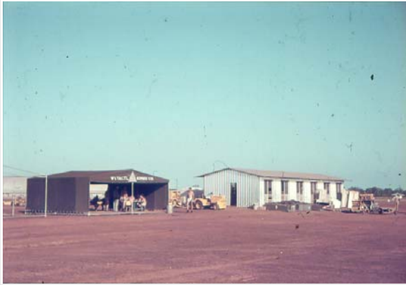
1SQN Tarmac Huts - Darwin - 1964