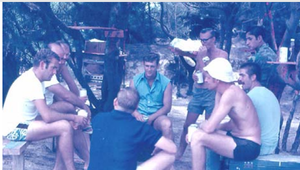
9SQN Barbecue - Back Beach - 1971