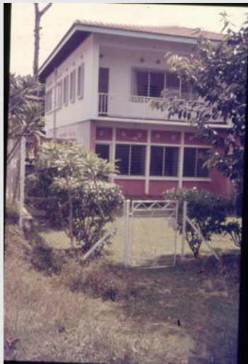
Our Married Quarter - Penang - 1965