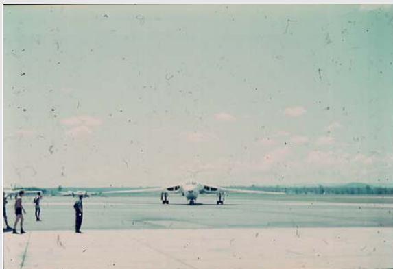
RAF Victor at Amberley - 1964

The other contributing unit was an RAF “V” Bomber unit, which supplied three Victor bomber aircraft. Each aircraft carried a cross trained fitter on board and each aircraft carried in its bomb bay pannier enough supplies for its aircraft support. So their three aircraft were completely self supporting.