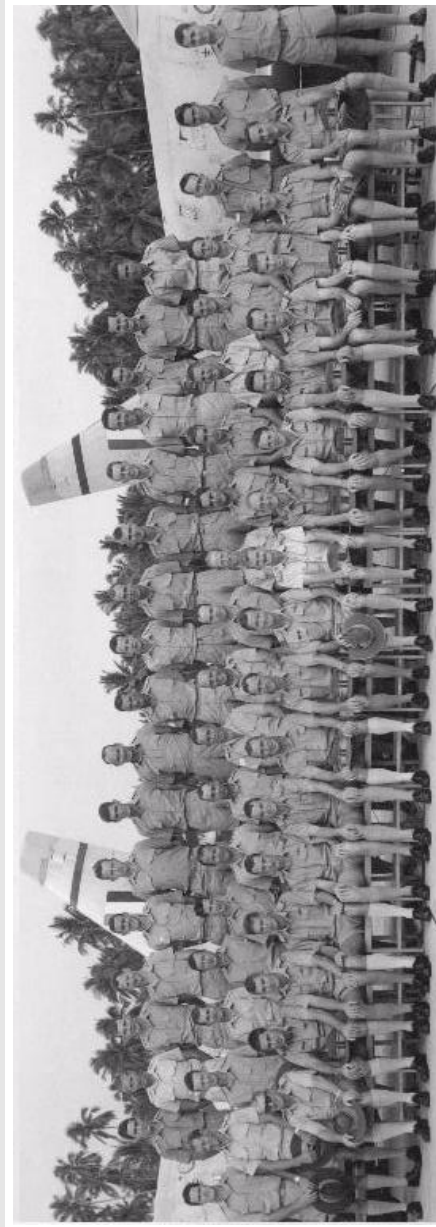
79 Squadron Group Photograph (Photo taken in late 1966)