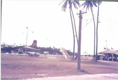
Cocos Island Airport - SEP 1965

After getting married in August 1965, we flew to Butterworth in September 1965 in an Ansett DC6B aircraft with an Ansett Flight Crew and a Qantas Cabin Crew, (31 hours from Sydney to Butterworth via Adelaide, Perth and Cocos Island). My wife and I stayed at the RAAF Hostel for the first five weeks of our stay before getting a Married Quarter on Tanjon Bunghar Road, Hillside, a suburb of Penang.