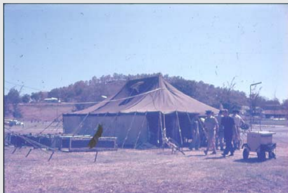
1SQN Flight Hut - Port Moresby - 1965

In July 1965, our squadron went on another deployment, this time to Jackson Field at Port Moresby. This exercise was a Photo Recce one only and no bombing took place. Each flight was for about 4 to 5 hours duration, as sometimes the intended target was covered with cloud, and an alternate target was then chosen. Our accommodation as well as the flight line and kitchen was all in the old Olive Drab tents. Indigenous labourers from Port Moresby were assigned to us to help with fuelling, general aircraft handling etc. I can still remember one chap who was helping to refuel one aircraft after a very long flight. The fuel flow from the ground fuelling installation was fairly slow, and we noticed that after fuelling nearly all the tanks, the undercarriage struts had not yet compressed due to their fuelled weight. We warned the local fuellers that when the strut did give, the wing tip may fall some distance. Well, this chap was sitting astride on the wing tip tank whilst filling the tank, the last tank on his side. Then the starboard strut gave under the weight of the fuel. The tip tank simply dropped a couple of feet from under him, and he landed back on the tip tank in the same posture a second later. He received such a shock that he leapt from the tank, flinging the fuel hose to one side, and fled across the strip into the jungle. He never returned to collect his pay and was never seen again!