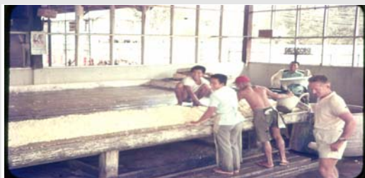
Rice Stalk base for Mekong Whisky