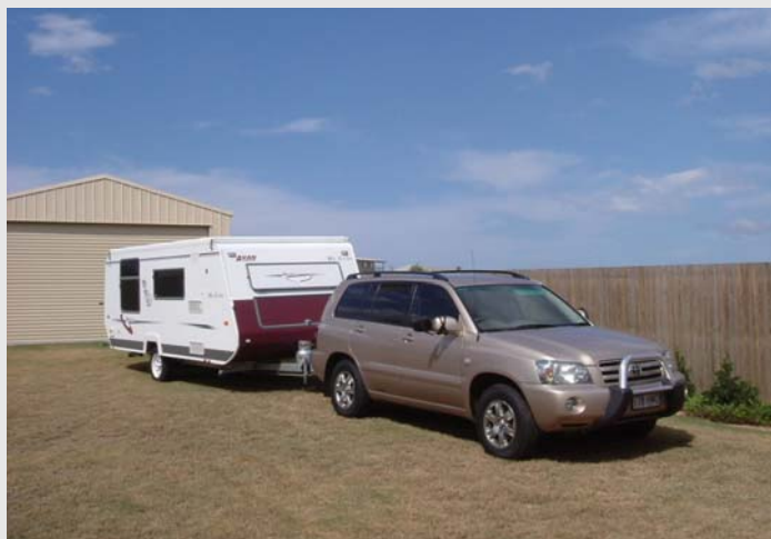
Toyota Kluger - with Caravan - November 2004

In December 2003, after my retirement and move to Queensland, we looked at a number of "All Wheel Drive" vehicles which would be suitable for us as a family car, and also suitable to tow a reasonable size caravan. After much searching, we decided on the newly released Toyota Kluger. It is certainly powerful enough for us, and roomy enough, and it can tow up to 1500kg. It is a dream to drive and handle so we are very happy with our retirement choice of car.