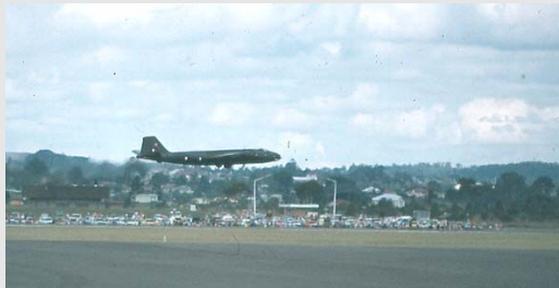
2SQN Canberra on takeoff at Amberley - 1981

Once again arriving at Amberley, it seemed like an old home. This time to work on the Canberra aircraft once again as a SGT and the aircraft by this time were a little geriatric. No 2 Squadron was a very fine squadron but by this time, they were having considerable airframe fatigue problems with the Centre Section Forging and the attachment points for the Wing Main Spars. The squadron trades had become far more integrated by now and this was a good thing. As other trades helped the armourers in the days of active service, we found we were helping the others when their chips were down.