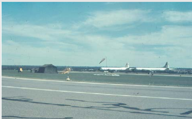
P3-B Aircraft departing from RAAF Pearce on exercise

From the first of these exercises to the last was a period of about 21 months, or about 91 weeks, in which about 172 days were spent on exercise, ie, about 27% of the total time. Most of my colleagues would comment that I got off very lightly, and they would be correct. Some other Senior NCOs were away from home a lot more than I was. For example, for a three month period during which our son was born, I was given amnesty from exercises away from home base. Therefore, when it was in theory my turn, another Sergeant Armourer would be asked to do the exercise. I still carried out all other “on Base” duties and rosters as required.