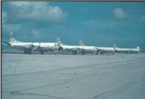
P3-C Aircraft at Diego Garcia - OCT 1980

it home again. Then on Wednesday, I took it to work again and at 0900, was told to board the Hercules with the rest of the party and we would be off to the exercise. In the few minutes available, I was able to telephone my wife to say I would see her in a few days. I was not permitted, at that stage, to tell her where I was going. However en-route to Perth, we were informed that a P3C had become unserviceable at Tengah in Singapore and we would be diverting there to rectify it. While the rectifications were being carried out, requests for our accommodation were being sent out to all bases over Singapore. Tengah was full due to a local defence exercise and hotel accommodation was totally out of the question, so we ended up at a NZ Army base in the middle of Singapore Island. It turned out to be an outstanding night of entertainment. As much as we tried, the CMC of the Sergeants' Mess would not let us put our hands in our pockets for any of the meals or drinks. What a night! Thankfully, the flight from Tengah to Diego Garcia the next day in the Hercules was spent sleeping.