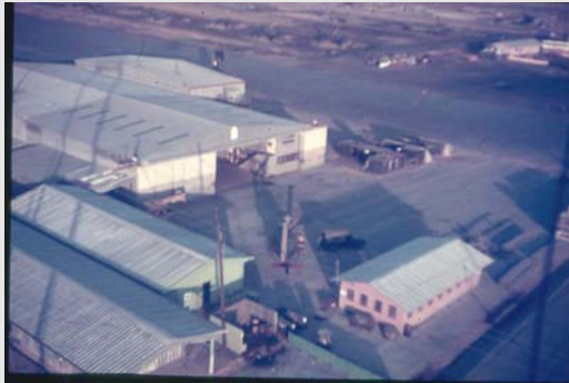
9SQN Maintenance Hangar - 1971

The hangar crew's daily tasks were primarily involved with the scheduled servicing of the aircraft. To maintain a high serviceability rate, a monthly "C" check was carried out each 16 days. Whilst this may have been interpreted by some outsiders as an "over-service", it was highly recommended due to the unpredictable and often high flying rate. Also, most of the flying was done within the top 10% of the performance envelope. Therefore, with 16 aircraft in the squadron's inventory, there was always one aircraft in the hangar receiving a "C" check. On the odd occasion when the Intelligence Officer warned the squadron that all 16 aircraft would be required on a certain day, that day's planned "C" check would be accomplished the previous night.