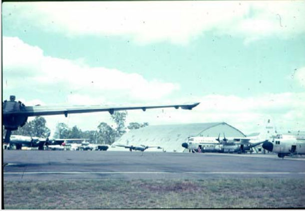
Amberley Tarmac During Exercise - 1964

One of the contributing units which came through Amberley were five F105 Thunderchief aircraft from the USAF, complete with their huge support aircraft entourage. This support aircraft consisted of at least three or four C124 Cargo aircraft for transporting all the required F105 aircraft support equipment and maintenance crews as well as at least three KB50 Air to air refuelling aircraft.