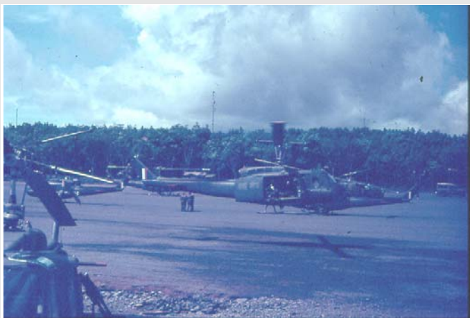
Busy Day at KangaPad - Nui-Dat - 1971

The accuracy of the Australian Iroquois helicopter gunship had become legendary. On many occasions, the gunship crews were given a target with the information that friendly forces were positioned some 40 to 50 feet to one side of the target and some 70 to 80 feet behind the target. Yet the gunship's crew could achieve a five foot group with the miniguns and place individual rockets within six feet of a target. This accuracy was far ahead of any US Army gunship as in the US versions, all their gunmounts were hydraulically controlled by the pilot to answer slight directional changes to the gunsight. In the Australian gunship, all the gun and rocket mounts were welded fast, and any changes in aim by the pilot were effected simply by a slight movement in the rudder, etc., just like any other ground attack aircraft.