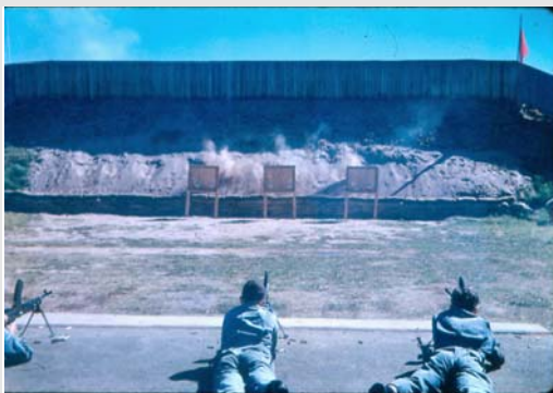
Firing the Bren Gun at the Range