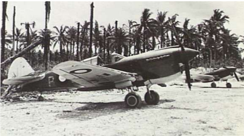
P-40 Kittyhawk of 77SQN at Momote airfield

Barges were slung over the side and landed a party on the eastern head. Advancing down the beach inside the harbour, the party reached the end of the strip and to their astonishment found it unguarded. The major in charge made a quick calculation, decided that with luck he could stay there, signalled the destroyers to unload the rest of the party and wirelessly General Swift, at Finschaven to get his invasion force underway.