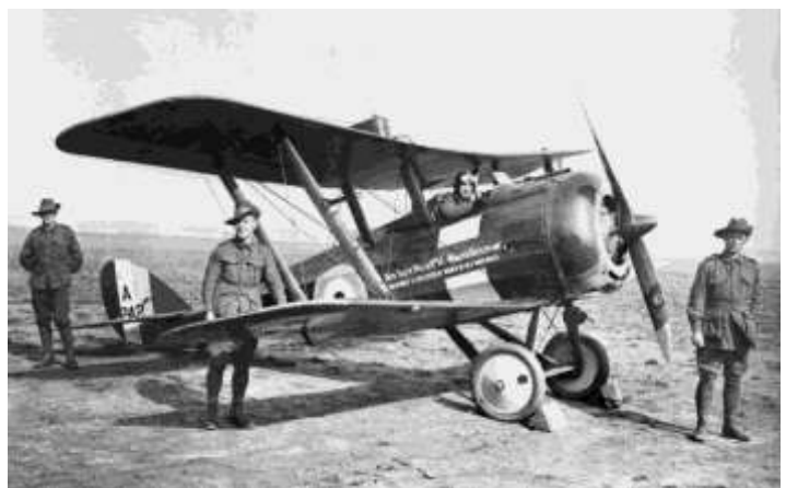
AFC No.2 Squadron De Havilland DH-5 scout plane 1917

Many of those who joined the squadrons on the Western Front also had prior service. The list of candidates for appointment to become flying officers in June 1918, for example, records a mixture of officers and other ranks: some had been gunners, others clerks, drivers, infantrymen, or members of the medical services. One man, a veteran of Gallipoli and the Western Front, had found his way into the 4th Australian Sanitary Section before being accepted into the AFC. Many were recommended for admission by their commanding officers on no other ground than their good record as soldiers in the line.