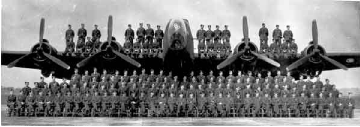
Group photograph of 158 Squadron in front and on top of a Handley Page Halifax Mk. III