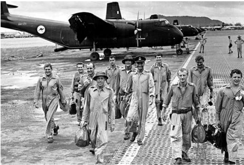
RTFV crews in Vung Tau, Vietnam

He and his wife managed their own nursing home at Windsor while he was a member of the RAAF. After he retired from the RAAF he farmed at Eungai Creek; later on, after lessons on laying bricks, he built his retirement home of double brick at Macksville and named it "Terra Firma" - the more firma