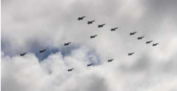
77SQN Birthday Flypast