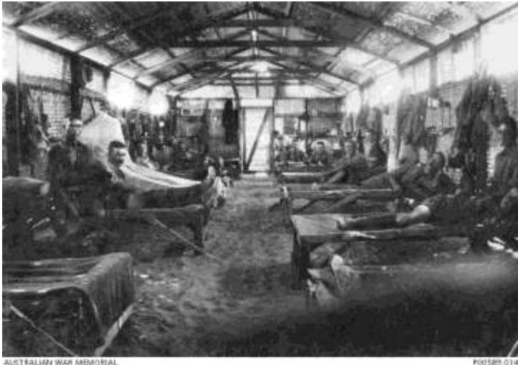
1 SQN AFC accommodation, Middle East, 1917

Given the nature of warfare on the Western Front, it is not difficult to imagine why men would seek to transfer into the AFC. Many had experienced the misery and squalor of the trenches. Those who knew they would face danger as long as they were in the AIF, preferred to face it in a corps which offered the promise of independence and glamour, as well as a degree of comfort unknown to the men in the trenches. Those who served in the Middle East, although spared the worst miseries of the Western Front, shared a similar desire to escape their own discomforts: sand, dust, and flies. Men who had already served in the ground forces reasoned that if they survived the day's flying they would at least have the chance to sleep in a comfortable bed.