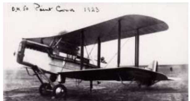
Fairey IIID A10-3 at Point Cook, Apr 22

On this day, a Fairey IIID floatplane surprised the US Pacific Fleet by sighting it at sea as it approached Australia’s east coast on a good will tour. The fleet of 56 vessels, including 12 battleships, was approaching Gabo Island following a previous visit to New Zealand. Two Fairey IIIDs from Point Cook were instructed by RAAF Headquarters to see if they could detect the approaching force, as a test of early warning. Taking off from Eden, NSW, the aircraft encountered appalling conditions and were soon separated. One of