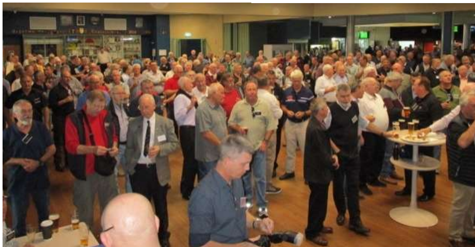
Members pay attention as the raffle is drawn