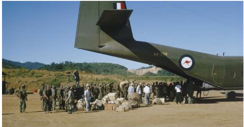
Wallaby Airlines A4-208