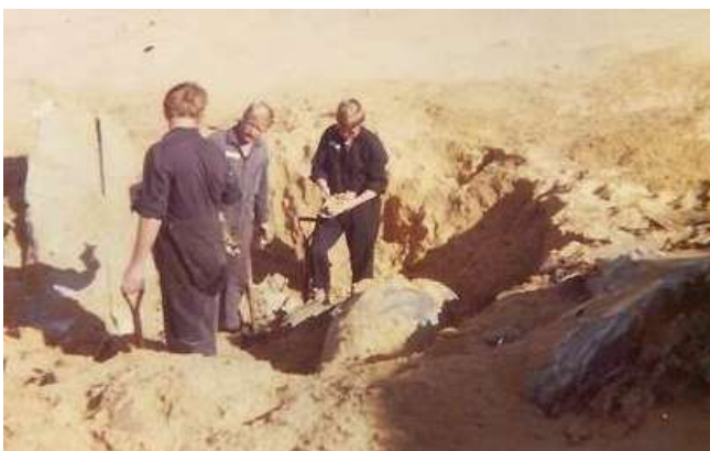
Airmen searching A94-924 crash site

Three Sabres and their pilots were lost during a nine-week period; the loss of A94-924 was followed by two further Sabre losses near Williamtown - No 2 Operational Conversion Unit (OCU) Sabres A94-926 on 7 March 1960 and A94-937 on 12 April 1960. In all three crashes, the canopy had been jettisoned but had struck the pilots, incapacitating them. Subsequent modifications to RAAF Sabres involved fitting of spring-loaded bolts to shatter the canopy during ejection sequences.