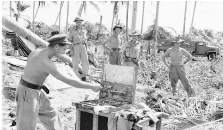
77SQN members watching an Army artist at work

Not many hours before, elements of the USA 1st (Cavalry) Division - without their horses - had effected a