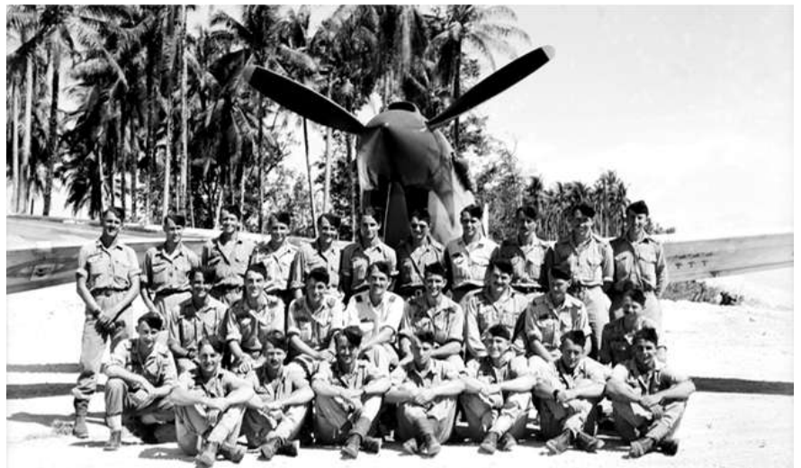
77SQN pilots with one of their P-40 Kittyhawks on Momote airfield

When we left Los Negros some months afterwards on a somewhat similar mission to Noemfoor (Dutch New Guinea) Los Negros had undergone a tremendous transformation. The Momote strip had been lengthened and a new strip built at Mockerang. Each day 50 to 150 Liberators were taking off, unloading tons of death and destruction on the Japanese navy installations at Truk and Guam, particularly.